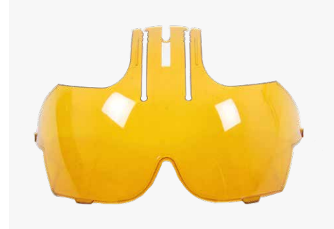
INTEGRAL VISOR Available in amber & clear