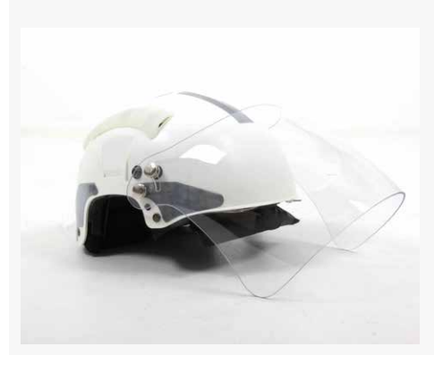
FULL MARINE VISOR