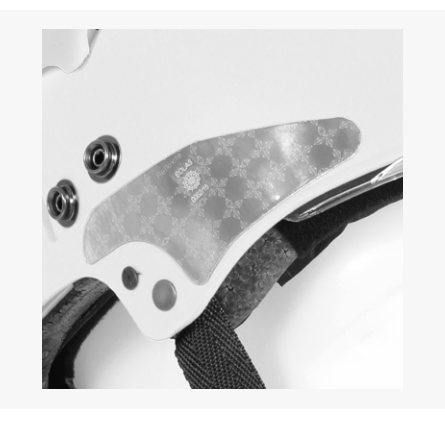
HIGH VIS SOLAS REFLECTIVE TAPE