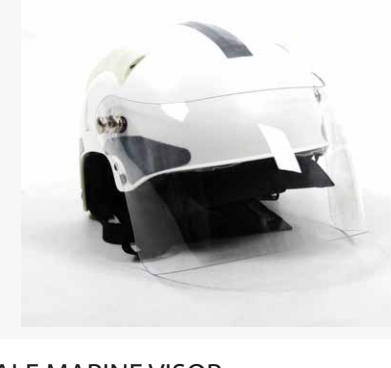
HALF MARINE VISOR