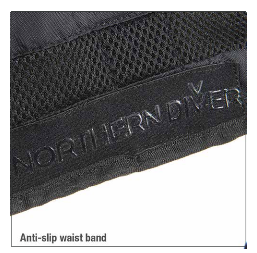
ANTI SLIP WAIST BAND