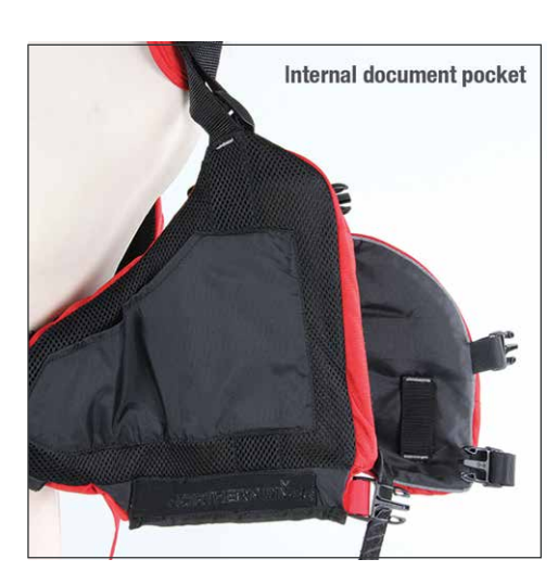
INTERNAL DOCUMENT POCKETS