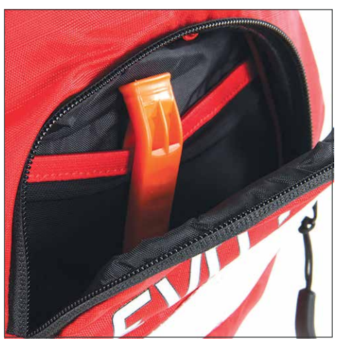
INSIDE POCKET : PEA-LESS WHISTLE