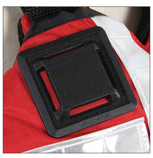
50MM 4-WAY LASH TABS