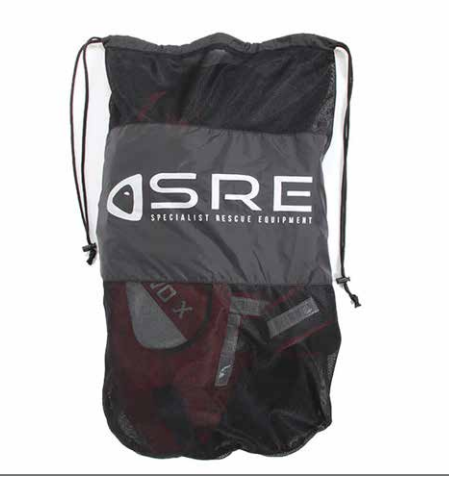
DRAWSTRING STORAGE BAG