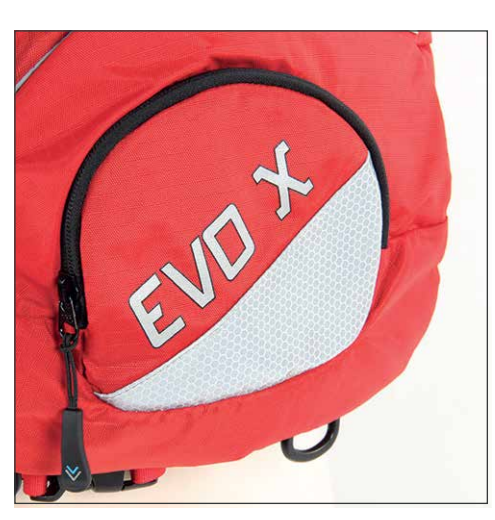
FRONT POCKET : ZIPPED CLOSURE