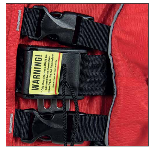
REMOVABLE CHEST HARNESS