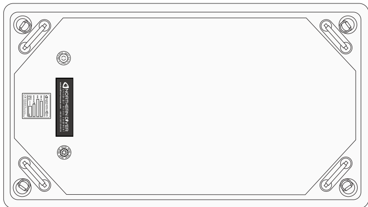
2m inflatable only weight: 25kg