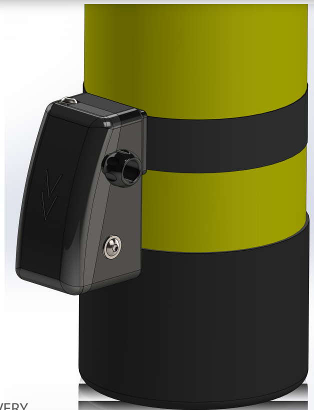
ASSET RECOVERY attached to cylinder band

Easily attaches to divers kit and keeps valuable equipment safe and recoverable